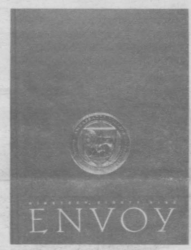
THE 1989 ENVOY

"Included are profiles of successful Ambassador College graduates whose achievements underline the