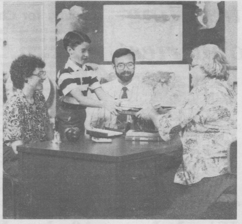
SMART PARENTS—One way to arrange time off from school during the Feast is to schedule a private conference with your child's teacher. Ask for assignments for your son or daughter to complete.

Use a system that works best for you and helps make your Feast a memorable one.