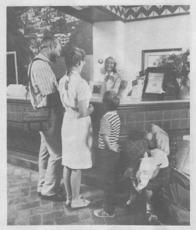
FEAST LIGHTS-When brethren set the right example, hotel owners look forward to their return. They remember brethren as the people who were neat and orderly and followed the rules.